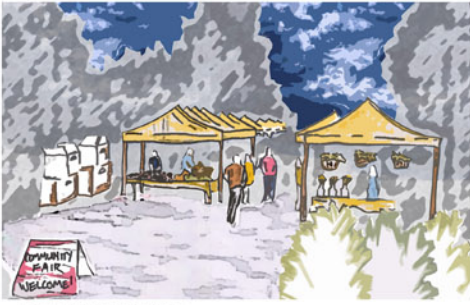
Multi-Use Parking Lots -transform underutilized parking lots into functional spaces -community building/cohesion/activity -recreation/sport courts/basketball -farmer markets/barter fairs -treat runoff