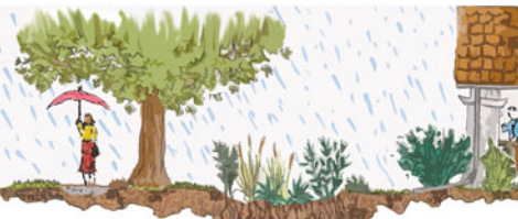
-stormwater treatment/infiltration -encourages street ownership -extend into owner yards/blending of public & private