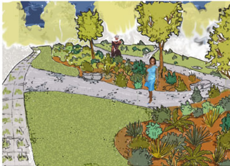
Green Street Scene -stormwater treatment -dedicated pedestrian access