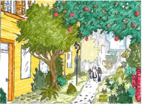
Alleyways -transform from barren to productive -important pedestrian corridors/connectivity