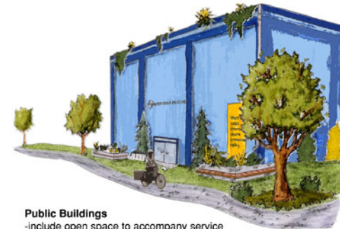
Public Buildings -include open space to accompany service