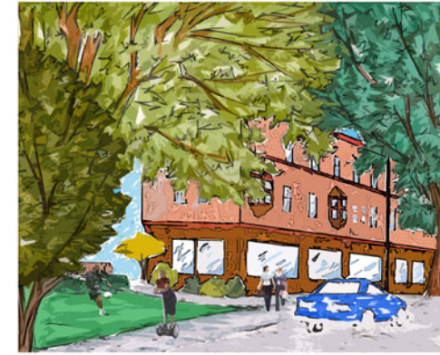
Mixed Use Development -where development occurs, focus on multi-use -public open space mandatory inclusion with development -encourage easy pedestrian accessibility

The street of the future accommodates pedestrian thoroughfare, treats stormwater, creates and improves habitat, provides permaculture, offers multi-functional open spaces & recreation, creating a greater cohesion between people, environment & function.