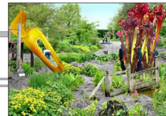
THEMATIC CHILD'S PLAY PARK CAPITALIZING ON THE FASCINATING ASPECTS WHICH GREENWOOD'S BOG HAS TO OFFER