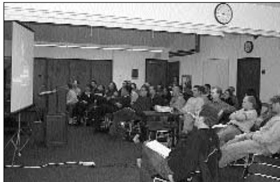
Spring Speaker Series audience views "A Fight in the Fields"