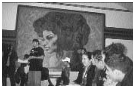
GROW participants role-play taking on a CEO at a board meeting.

This year's GROW training expanded to include both a greater diversity and larger number of participants, increasing from 18 last year to over 30 in 2002. Student leaders who attended focused on a variety of issues, ranging from racism to the environment, labor, educational access, and global