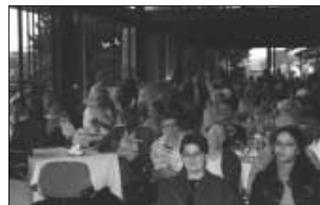
Audience enjoys presentations at 2001 Annual Awards Banquet