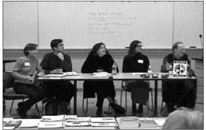
Beyond the Boycott panelists