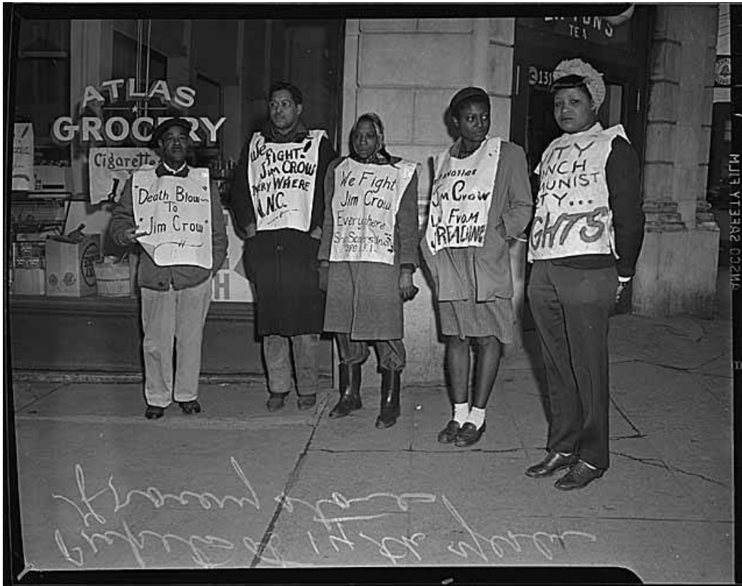
Figure 1: African American protestors in front of Atlas Grocery, Seattle, 1947. The various affiliations that can be seen are: “N.N.C” (National Negro Congress) – second from left, “Ship Scalers Local 589 (A.F.L.)” – center, and “Communist Party” – far right.