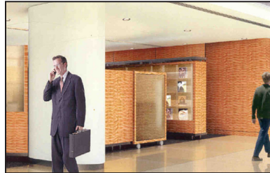
The Resource Center will be located in the main hospital lobby next to the Gift Shop.

With oversight by a patient, family, and staff advisory committee, the Center will be staffed 40 hours per week. The Center will feature four computer stations – one fully ADA accessible – where users will be able to access the Internet, select bookmarked Web sites, view patient education databases, and read on-line journals and newsletters.