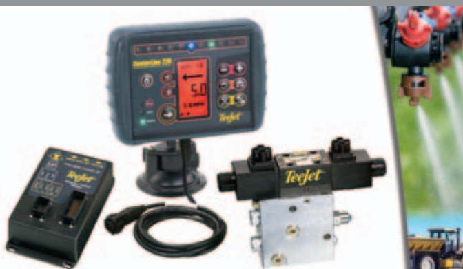
FieldPilot 220 System Components (clockwise from top): CenterLine 220, Steering Valve, Steering Control Module

Extremely simple and incredibly affordable assisted steering