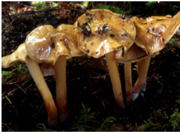
Phaeocollybia gregaria is an endemic Oregon gilled mushroom thus far verified only from the Cascade Head Experimental Forest (Lincoln County) and a 150year old BLM Reserve Forest near Pedee in near-by Polk County.

The BLM approached the Institute of Natural Resources and the Oregon Natural Heritage Information Center and requested that the program evaluate the second question for all of the Survey and Manage Species. The lawsuit required that the BLM and USFS develop this information and complete the EIS in less than six months. As a result, the Information Center was given barely 2 months to put together a team of experts to evaluate the status of each of the 312 species throughout their entire global range, as well as in each of the three U.S. States (Washington, Oregon and California) covered by the Forest Plan. The status evaluation required the development of Heritage Global and State Ranks. Each rank was developed by evaluating the species abundance,