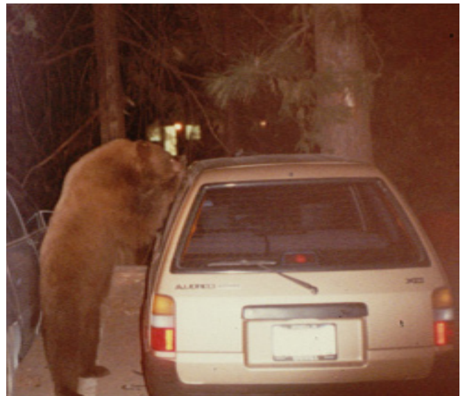
Photo from a University of Idaho/NPS project final report: Bear Element Assessment Focused on Human-Bear Conflicts in Yosemite National Park

For NPS projects: Unless otherwise noted, complete copies of all final products must be sent to the CESU office c/o the NPS Research Coordinator for archiving. In addition, three copies of all final deliverables must be sent to the NPS Columbia Cascades Support office. These requirements are clearly outlined in all NPS Task Agreements. In addition, please send a short electronic abstract of results for inclusion on our web site to woodmant@u.washington.edu .