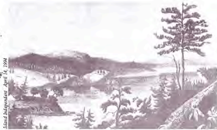
Island Independent April 14, 1994

> 1850s drawing of Penn Cove, from the Pacific Railroad Survey.