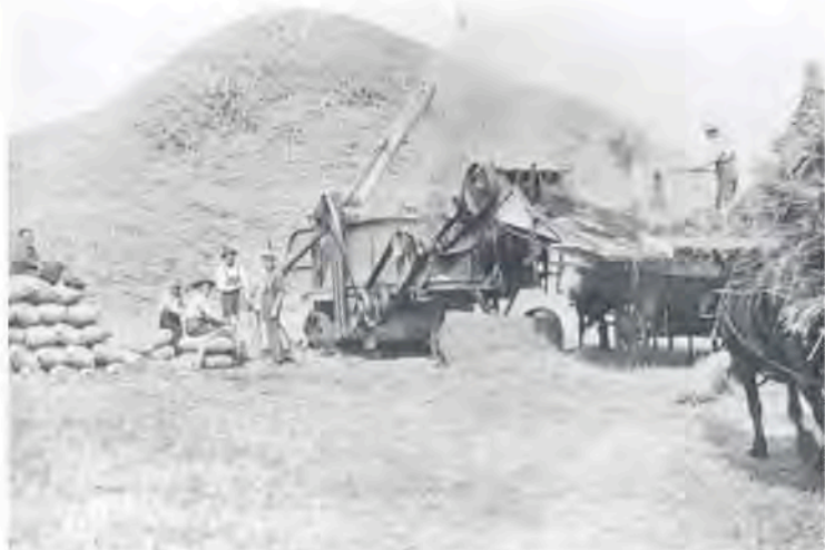
Farmers worked together to harvest grain, moving a steam powered thresher from farm to farm.

The history of agriculture on Whidbey's prairies is one of cooperation, from farmers helping each other with grain harvest to jointly purchasing new machinery and barn silos, establishing cooperatives for processing milk products and marketing eggs, and gaining singularity in disease-free cattle and uncontaminated seed production. JoAnne Engle Brown recalls prairie farmers during the harvest season in the 1930s: "The harvest crews often consisted of more than 20 men from around the prairie. Wagons and horse teams were shared as each farm's grain was harvested."