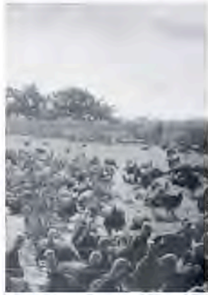
University of Washington Library