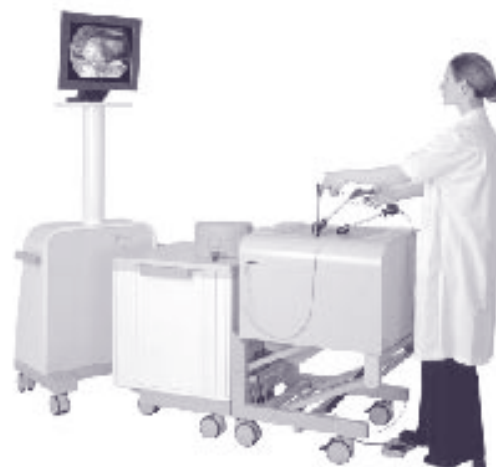
FIGURE 2: Xitact Laparoscopic Cholecystectomy simulator illustrating the portable system and video image.