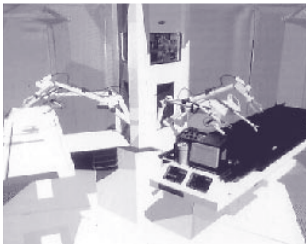
FIGURE 4: OR of the future – concept drawing from Integrated Medical Systems.

room — one which decreases the number of personnel required, increases efficiency and quality control, and which incorporates the robotic system into the hospital