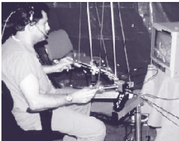
FIGURE 3: Zeus surgical robotic system.