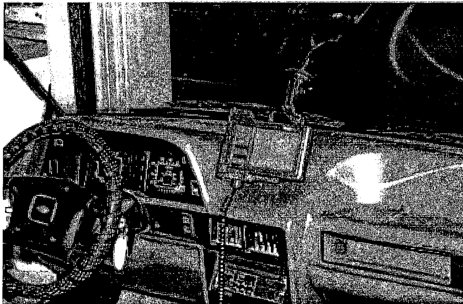
Figure 2: View of TrafficMaster mounted in car.

A fixed-based driving simulator was used for the experiments. The simulator consisted of a Ford Escort car frame equipped with seats, steering wheel, windshield, dashboard, and brake and gas pedals. A color screen projector displayed a life-size graphical representation of the driving scene.