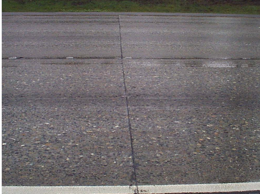
Figure 1. Single sawed transverse joint (1969 construction, diamond ground in 2000, photo taken in 2001)