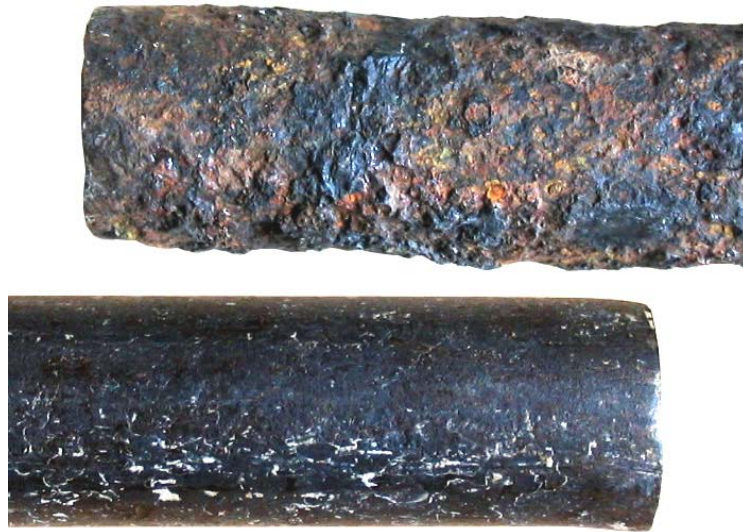
Figure 2. Plain steel dowels: corroded (top) and not corroded (bottom).