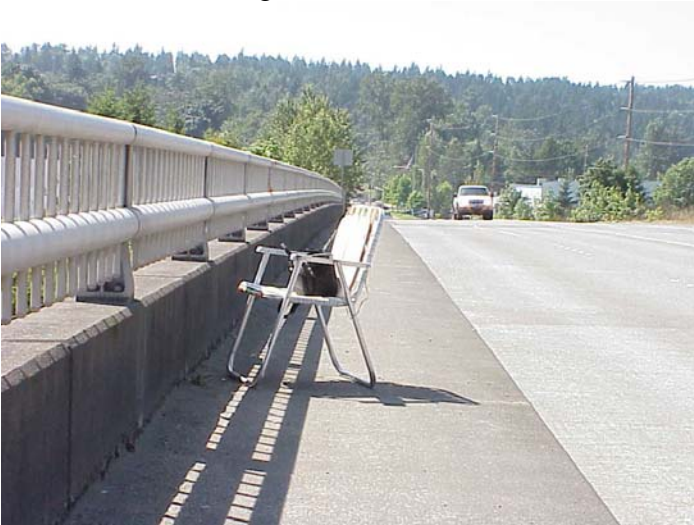
Southbound Viewing Location: