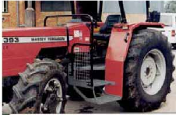
Figure: An example of a retro-fitted tractor access platform to prevent runover incidents.