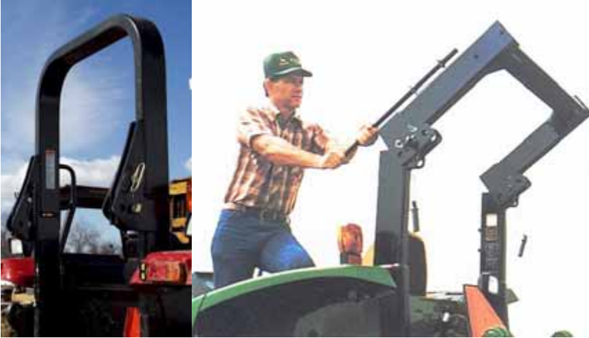
Figure: Two examples of folding ROPS systems installed on tractors.