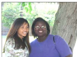
In front of MLK Library in San Jose