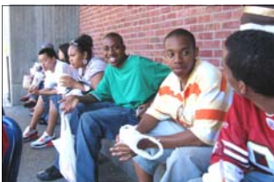
Winding down SJSU Tour