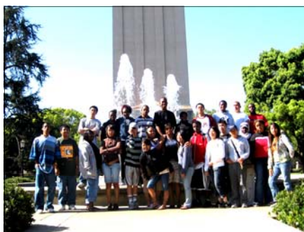
Group Tour of Stanford