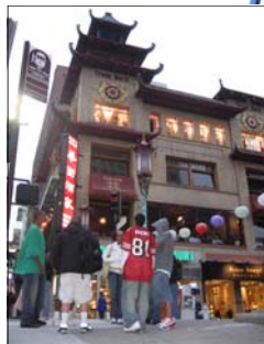
Orientation San Jose State U