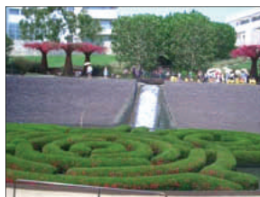
Gardens at the Getty's Museum