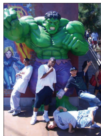
Posing with the big guy at Universal Studios