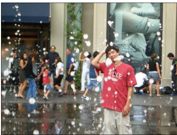
Fountain fun at UCLA Campus