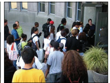
Students touring campus