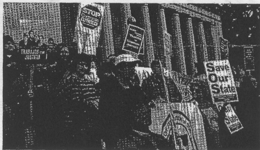
Organized State Employees