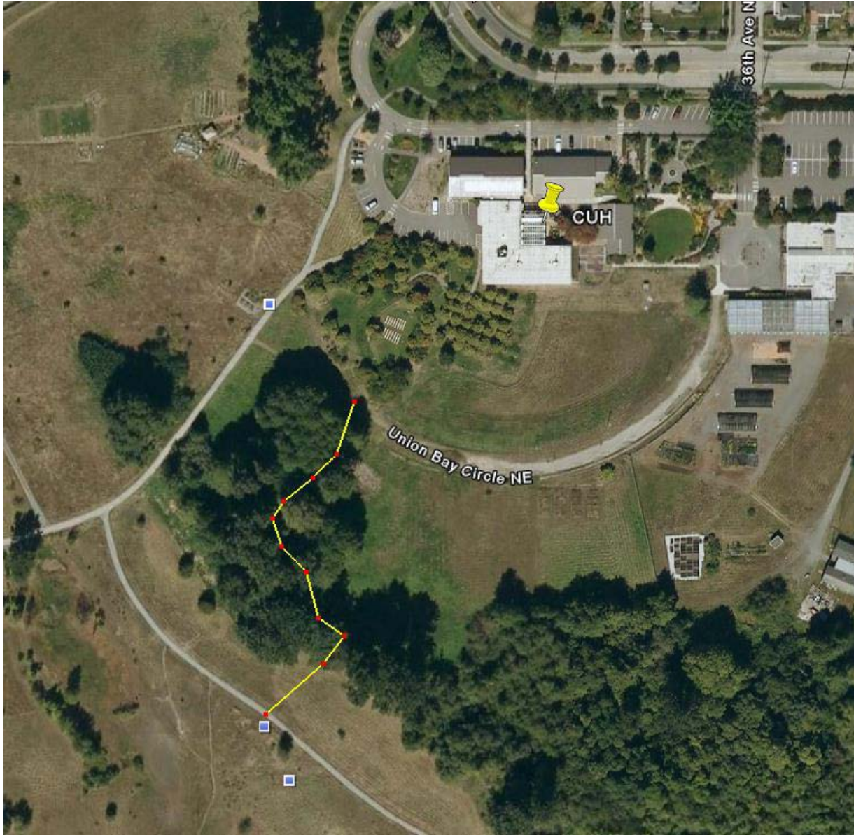
Possible route of creek crossing behind CUH (510 feet)