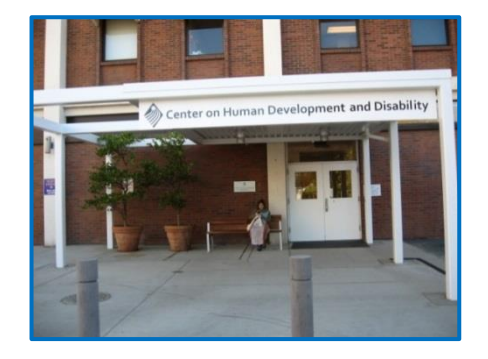
Ground Floor Entrance