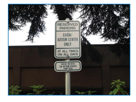
UWAC Pre-Paid Parking Signs