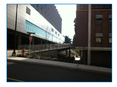
Main Entrance to CHDD

The CHDD is a 4-story brick building just east of the S1 parking lot. There are two entrances. The main entrance facing the UW Medical Center leads you up a ramp and directly into the reception area. The ground floor entrance door takes you to the 1<sup>st</sup> floor East Entrance. Take the elevators up to the 2<sup>nd</sup> floor reception area.