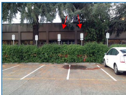
UWAC Pre-Paid Parking Spaces Picture 2