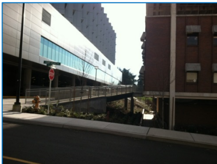
Main Entrance to CHDD

Please check in at the reception desk. The receptionist will take your temperature and review a symptom checklist with you. If you are late, can't find your way, or your clinician has not met you, please call your Patient Navigator or person you are visiting.