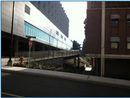
Main Entrance to CHDD

The CHDD is a 4-story brick building just east of the S1 parking lot. There are two entrances. Please do not park in front of the Ground Floor Entrance. Please pull into the loading lane in front of the Main Entrance. The main entrance facing the UW Medical Center leads you up a ramp and directly into the reception area.