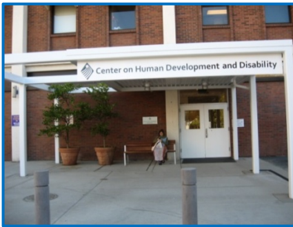
Ground Floor Entrance