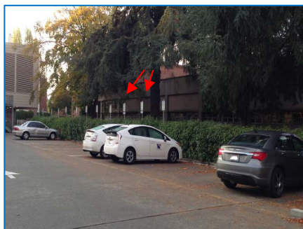
UWAC Pre-Paid Parking Spaces Picture 1