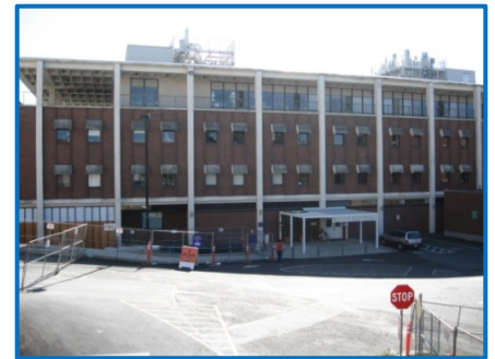
CHDD from S1 Parking Lot