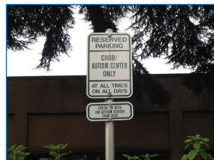
UWAC Pre-Paid Parking Signs