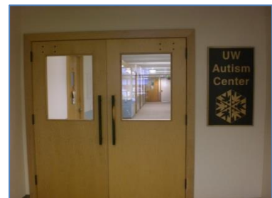
Entrance to UWAC

Please check in at the reception desk. If you are late, can't find your way, or your clinician has not met you, please call your Patient Navigator or person you are visiting.