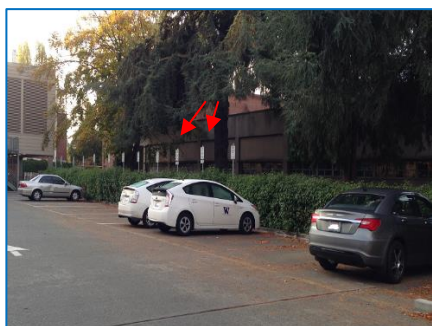
UWAC Pre-Paid Parking Spaces Picture 1