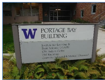
Sign of PB Building