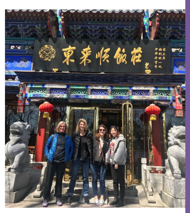
Delegation to Beijing, China

Leadership staff at the UW Autism Center