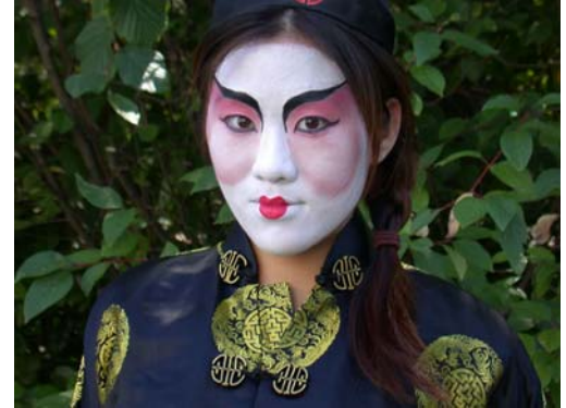
Students present their projects from Introduction to Theatrical Makeup.

The School of Drama has a wonderful little secret. For the past ten summers, it has offered what has become one of our most popular classes, Introduction to Theatrical Makeup .