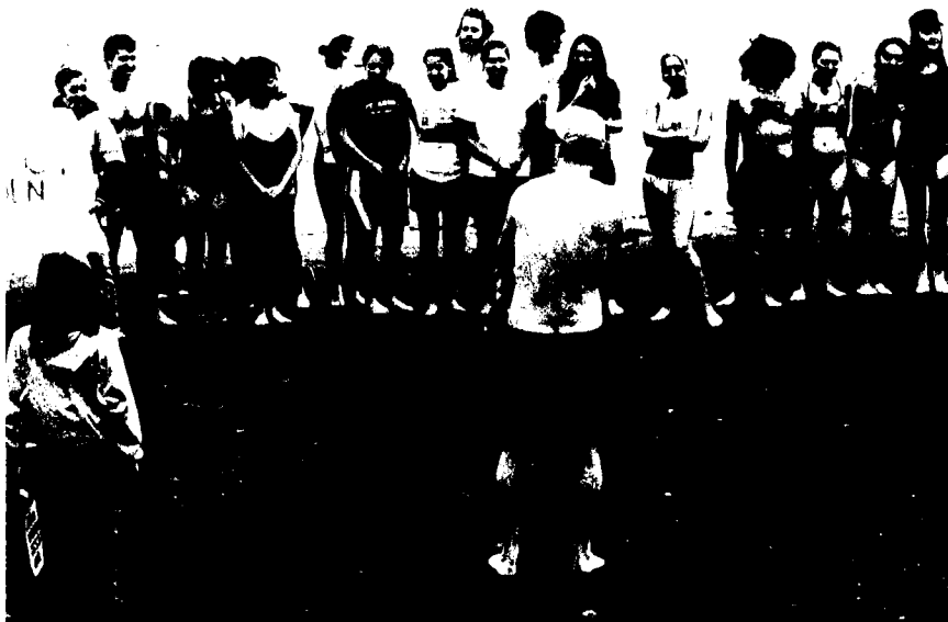
With Focus the Nation, students and community members like these in Portland, Oregon, are gathering to share ideas about global warming solutions.