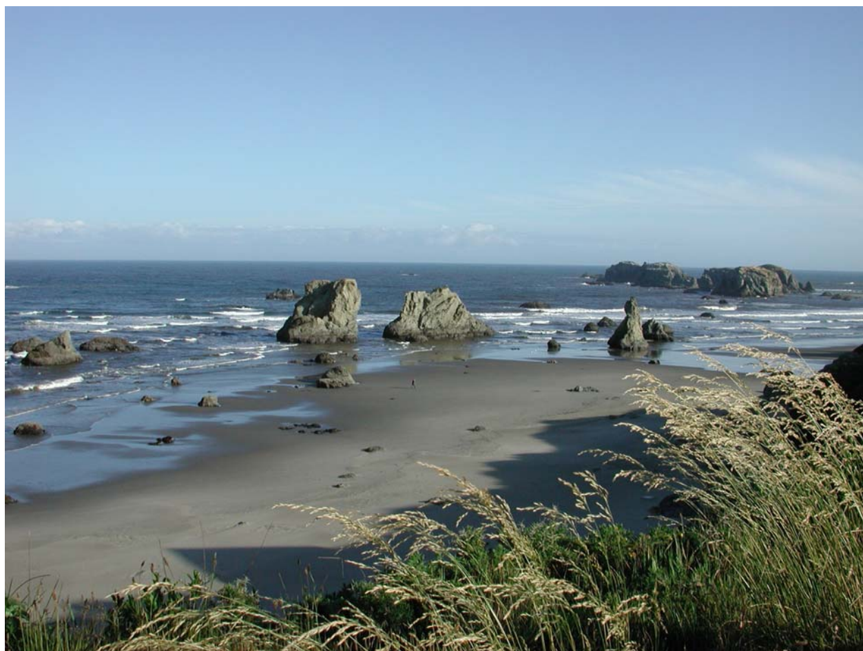
Rural Oregon Coast

Policy Implications: HCs face many challenges in providing care for the nation's underserved populations as their role is being expanded. It is clear that the HCs employ substantial numbers of dentists and that there are significant numbers of vacancies, with especially high vacancy rates within the nation's more rural areas and urban persistent poverty areas. This may underestimate the shortages because HCs may eventually stop recruiting when they are unable to fill positions. As the HCs expand their capacity to care for the nation's underserved, the need for a well-trained cadre of dentists and health care providers will increase. The HCs are already heavily dependent on dentists currently fulfilling NHSC and state loan program service obligations and are vulnerable to reductions in those programs. Actions must be taken to ensure an adequate supply of dentists who are willing to practice within HCs at salaries that the HCs can provide. While there is a wide array of policy options available, action is needed to facilitate the current and expanded role of the HCs in order to provide oral health care for the nation's underserved.