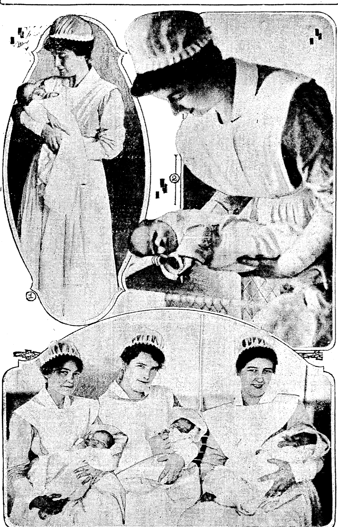
These pictures show some of the presidents, railroad directors and senators of the future—their first and only photographs, in the baby ward at Rees's General Hospital. On the shoulder of each baby is a small piece of adhesive tape on which is written in ink the name of the parents—they are only mixed in novels and on the stage—never in real life, if they get their start in the baby ward.