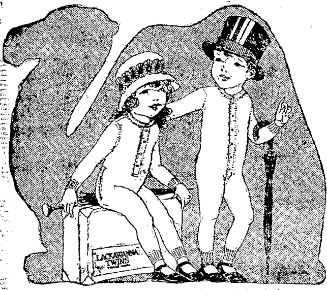
A "Lackawanna" box is fine to travel on by night or day—When you wear underwear like mine, You lie in comfort all the way.