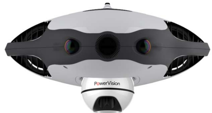
PowerRay Fishing Drone