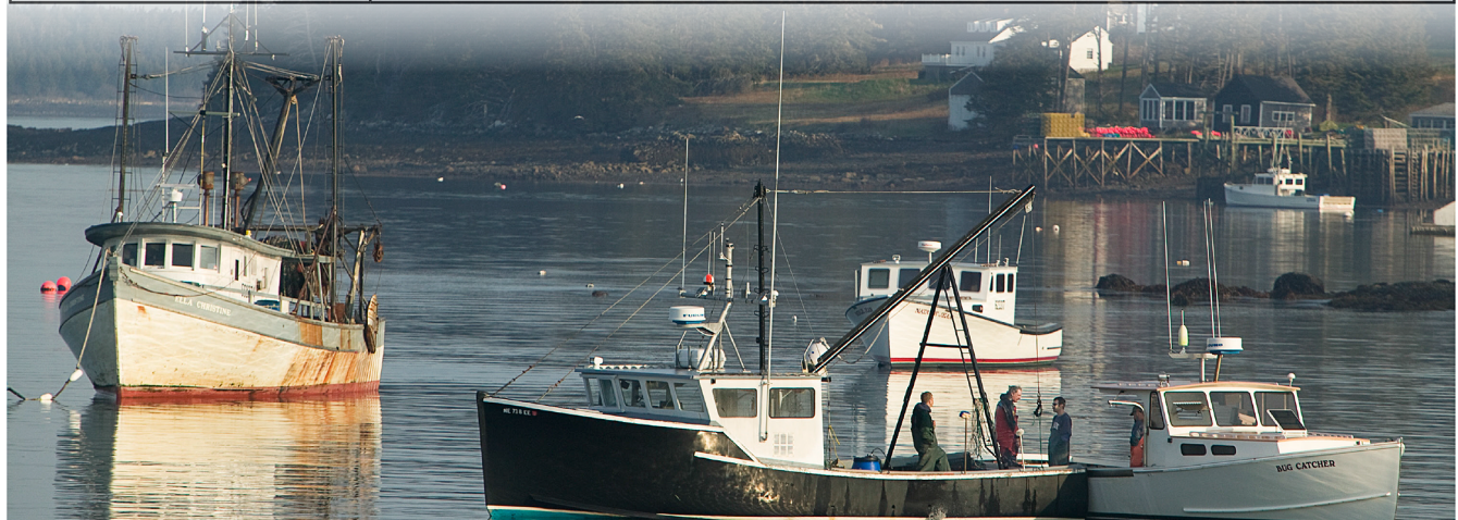
Figure 1. Elements of the Working Waterfronts Toolkit