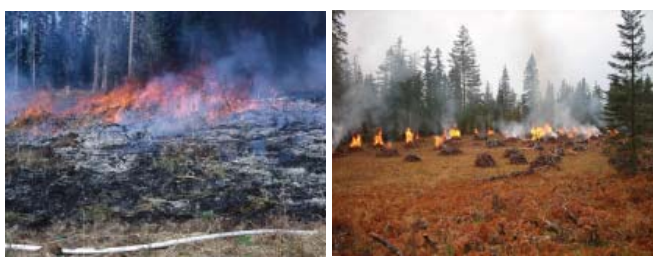
The two fuel-reduction treatments: (left) broadcast burn and (right) pile and burn.

Residual slash settled to the ground as snow melted that spring. It was either left in place in the broadcast burn treatments or hand piled. After a summer of curing, fuels were broadcast burned in late September, aided by a system of fire lines and hoses. Slash piles were burned in November at the onset of fall rains, when risk of fire spread was low. "For both treatments, fuel and weather conditions were ideal and implementation was excellent," says Halpern. "We owe much to the skills and dedication of our collaborators on the Willamette National Forest."