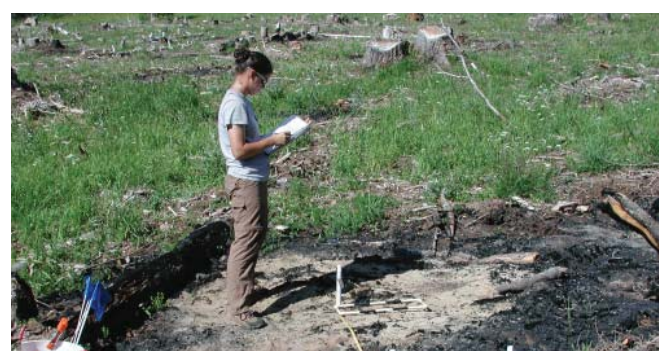
A burn-pile scar one growing season after treatment.

Despite significant alteration of soil properties in the broadcast burned treatments (and in the burn piles), the team was surprised to find that weedy species were uncommon. This was unexpected given their prominence in the seed bank. This, too, may be good news for managers, although continued monitoring is needed to determine what role these wind-dispersed species will play in the future. The scars left by burn piles in particular, may serve as foci for future invasion and subsequent spread into the adjacent vegetation.