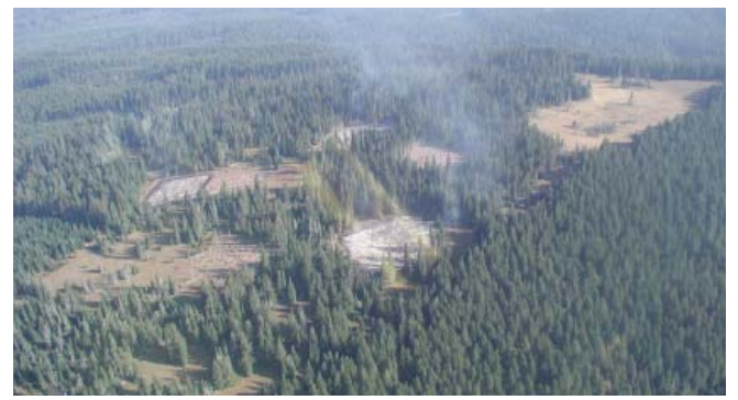
Aerial view of Bunchgrass Ridge one day after broadcast burning. Slash piles visible in adjacent pile and burn units were treated subsequently.

Three treatments, replicated three times each on 2.5 acre plots, included (1) a control (no harvest), (2) trees removed with the resulting slash piled and burned (leaving most of the ground surface unburned), and (3) trees removed with the slash broadcast burned.