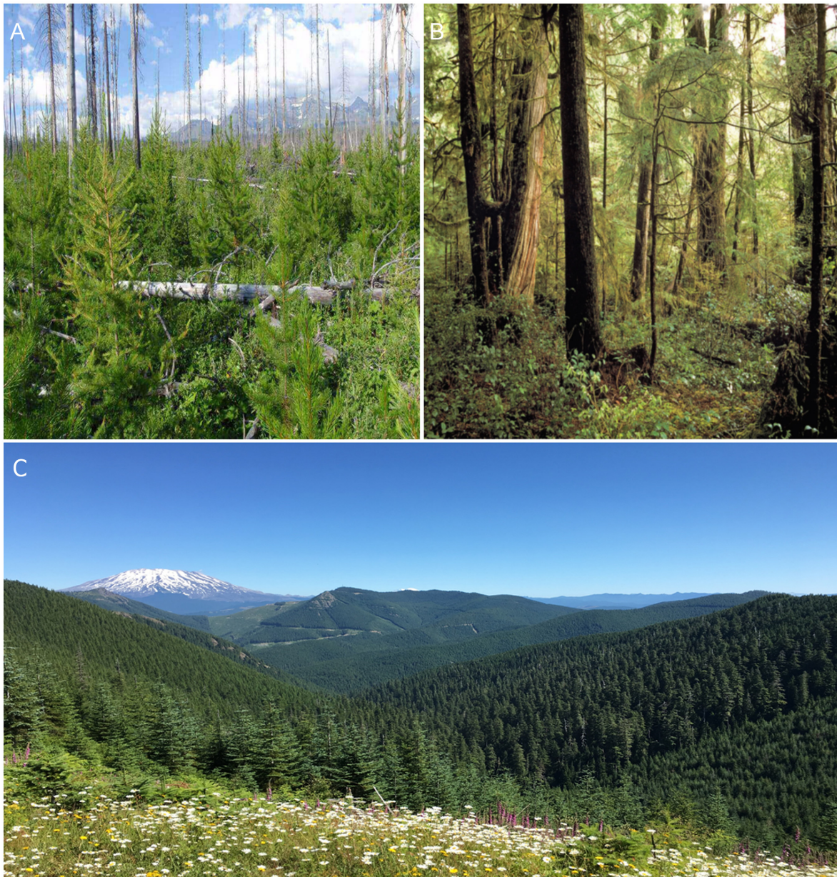
Fig. 1. Examples of stand-replacing systems where wildfires tend to be more limited by ignition source and weather rather than fuel. (A) A naturally regenerated lodgepole pine ( Pinus contorta var. latifolia ) patch ~10 yr post-fire, (B) an old-growth western red cedar ( Thuja plicata ) and western hemlock ( Tsuga heterophylla ) stand, and (C) a multi-aged and partially managed Douglas-fir ( Pseudotsuga menziesii ) and noble fir ( Abies procera ) forest consisting of both recently harvested patches (right foreground and far background), 115 yr-old patches originating from a 1902 wildfire (left foreground), and old-growth patches that escaped the 1902 fire (above the recent harvest on right).

alter ecosystem composition and structure, because they start from a very low number (i.e., the low annual area burned of the current and/or historic eras). Moreover, because these forests are