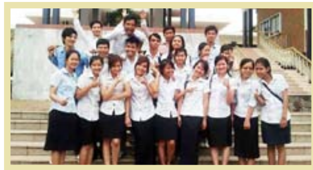
Cambodia's first social work program, cohort # 1.

As Cambodia transits from reliance on foreign aid to locals working on the ground, advocates and aid workers hope the local angle will change its ability to address the issues that have plagued the Kingdom for decades.