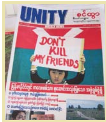
Newspaper coverage of ongoing war in Kachin State, July 2012

there was something wrong with the assumptions of those who expected the longest running dictatorship in the last fifty years to collapse, implode or surrender in the face of economic sanctions, isolation, and a non-stop cascade of UN General Assembly resolutions against it. My frequent research trips to Burma had suggested the military was far from the brink of demise. Although there were obvious signs of "cracks in the edifice" of Tatmadaw rule, there existed vibrant political, literary, artistic and civil societies that were anything but crushed by the political oppression. I found it hard to ignore the particular, long-term historical roots for the kind of coercion-intensive state-society relations that had come to dominate post-colonial Burma.