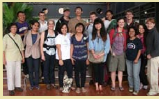
Task Force collaborative research team, 2012.