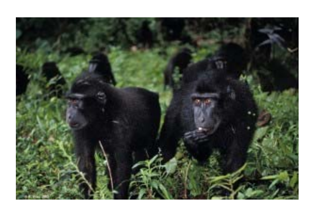
Juvenile Sulawesi black macaques (Macaca nigra) foraging in the Tangkoko Nature Reserve.

The <u>findings</u>, published in the January issue of the American Journal of Primatology, are from the longest ongoing survey of Macaca nigra and are among the first evidence that the monkeys may be in better shape.