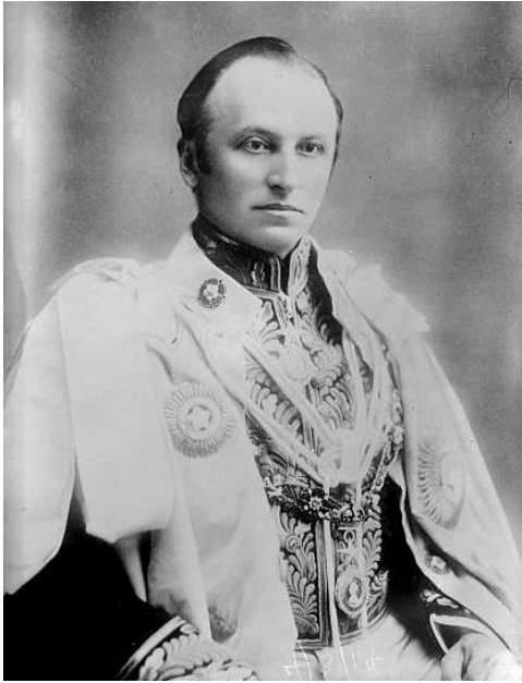
Figure 1. Lord George Nathaniel Curzon, Viceroy of India, 1898-1905.

Ross was by no means an anti-imperialist; believed that the British were “superior to subject peoples in natural ability, integrity and science... They [had] introduced honesty, law, justice, order, roads, posts, railways, irrigation, hospitals... and what was necessary for civilization, a final superior authority.” 21 Still, he and other scientists worried that the government in India was hindering British research. Ernest Hart, editor of the British Medical Journal , said in 1894 that the Anglo-Indian authorities regarded research as an administrative “nuisance,” and that they followed a course of “respectable conservatism” rather