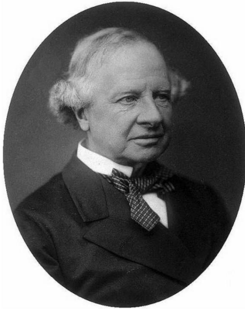
Figure 2. Granville George Leveson-Gower (Second Earl Granville), Secretary of State for Foreign Affairs, 1880-1885.