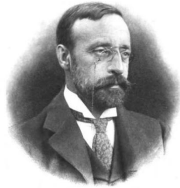
Figure 4. Sir Walter Frederick Miéville

To make themselves appear objective, British officials characterized the contagion theory as prejudicial and politically motivated. Early in the body of his report, Hunter writes that, “It is hardly worth while to discuss the oft-repeated and oft-refuted story of the importation of the disease from India,” and yet he subsequently devotes the balance of the report refuting that very same “story.” 75 Had contagion not gained so much sway in the minds of Europeans and Egyptians, Hunter presumes that his task would be much easier: