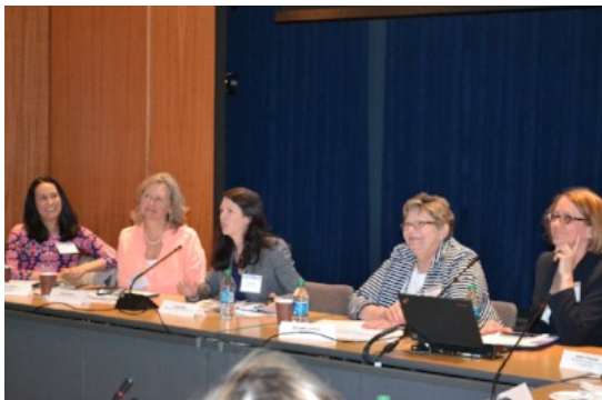
Leaders of Health Workforce Research Centers discuss latest findings