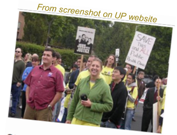
Students from the "Students in the Community" project advocate for better health care for the underserved.