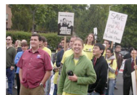
Students from the "Students in the Community" project advocate for better health care for the underserved.