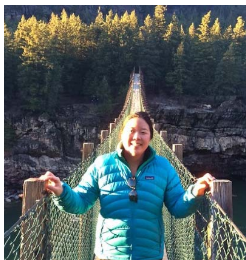
Braving the Kootenai Falls Swinging Bridge