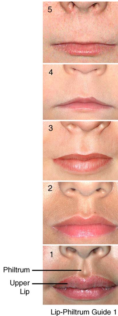
Fig. 1. Fetal alcohol syndrome lip—philtrum guide.

preadoptive review are not able to be accurately assessed with this software tool unless families have taken the photographs themselves. Before traveling to a child's birth country, parents may be prepared in advance to photograph a child accurately, with an internal measure of scale allowing for later analysis. Our clinic uses an office supply sticker of known width that is placed on the patient's forehead. A close-up photograph should be taken with the patient's unsmiling and relaxed face filling the entire frame. A digital 3-megapixel (or higher resolution) camera is ideal. The lens of the camera should be directly in front of the face (the "Frankfort horizontal plane") to minimize rotation of the face