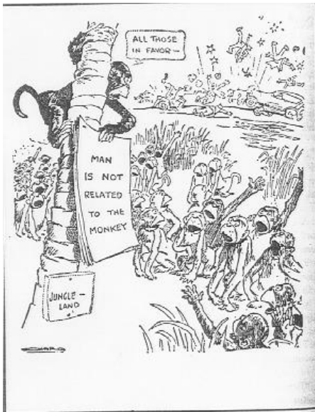
[11] "The Proposition Would Get a Lot of Support if the Monkeys Could Vote on It." (Orr in the Chicago Tribune )