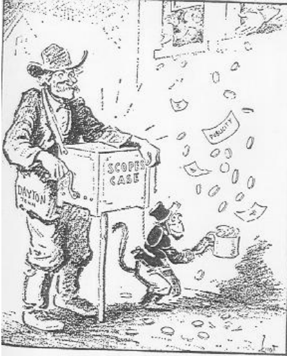
[6] Playing It for All It's Worth. (Knott in the Dallas News )