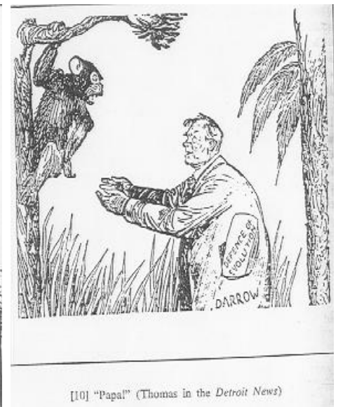
[10] "Papal" (Thomas in the Detroit News )