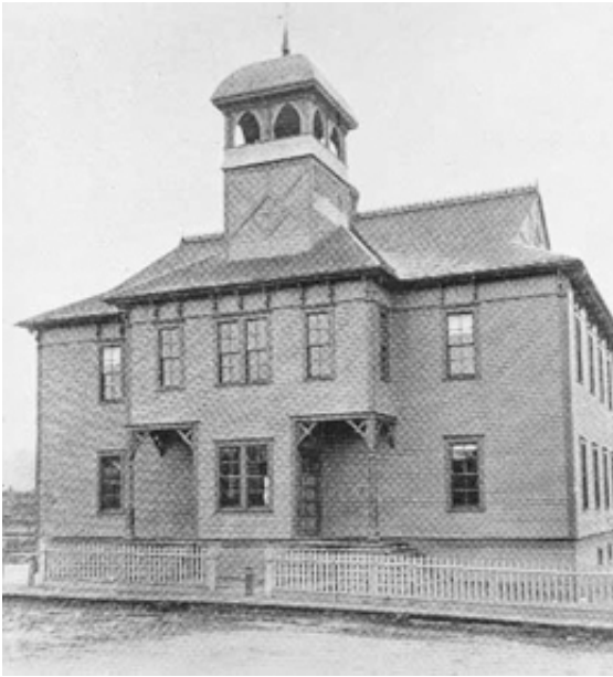
Latona School, Seattle, ca. 1892

Courtesy Seattle Public Schools (Image No. 241-1)