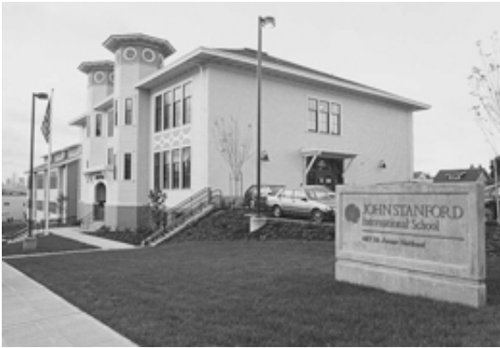
Latona School, Seattle, 2001

Courtesy Seattle Public Schools (Image No. 241-4)