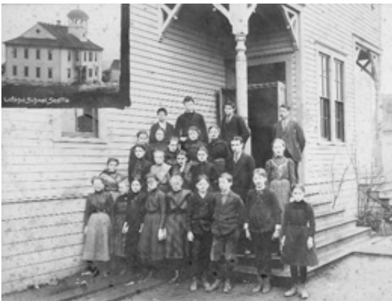
Students, Latona School, Seattle, 1900

Courtesy Seattle Public Schools (Image No. 241-1)