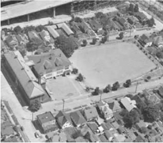
Aerial view, Latona School, Seattle, 1960