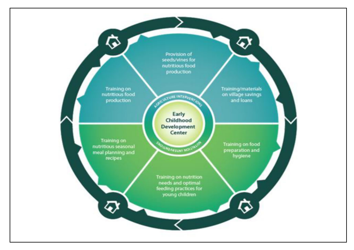
Figure 1. Program design (Nutrition Embedded Evaluation Program Impact Evaluation).

purchase supplies for the CBCC and for use in emergencies.