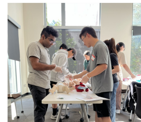
UWEMS x American Red Cross CPR/AED/First Aid Instructor Training