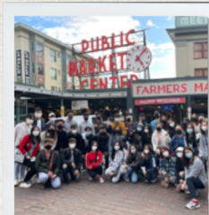
Welcoming Tour '23