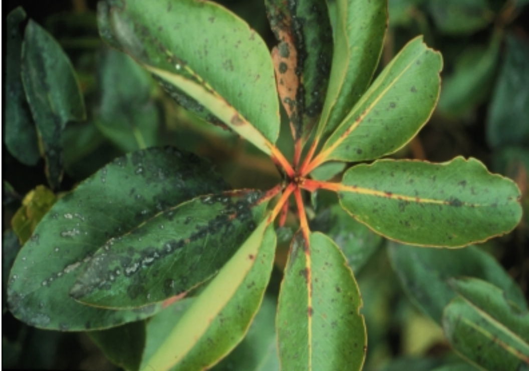
Plate 5-1 Fungal leaf spots. At least 19 fungi cause leaf spot on Pacific madrone.

Plate 5-2 Leaf gall (blisters) caused by the fungus Exobasidium vacinii . Round, dark brown blisters form on the upper leaf surface; a white fungus growth forms on the underside and on infected fruit (byther, et al. 1996).