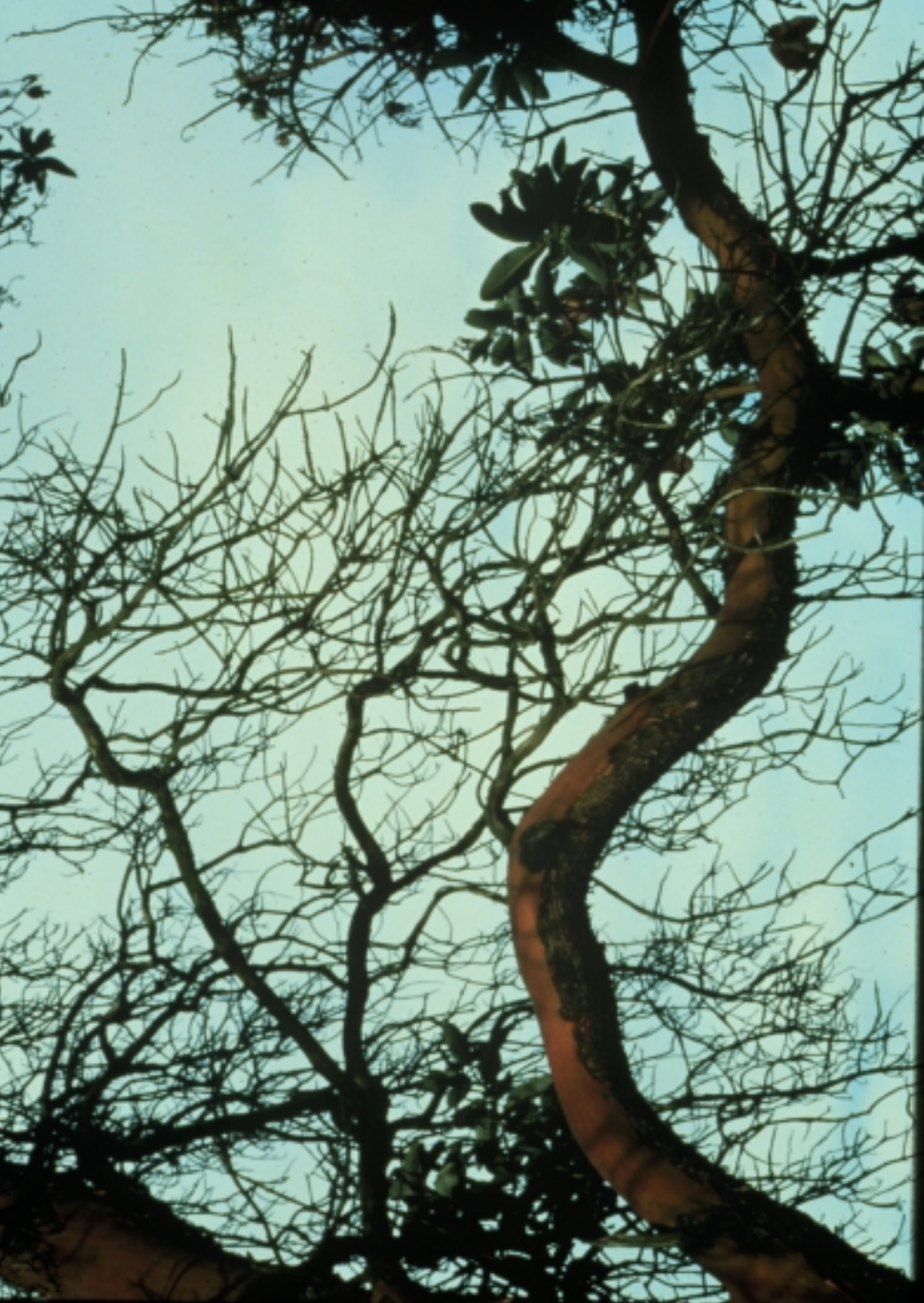
Plate 5-6 (above). Madrone declining due to Nattrassia infection.