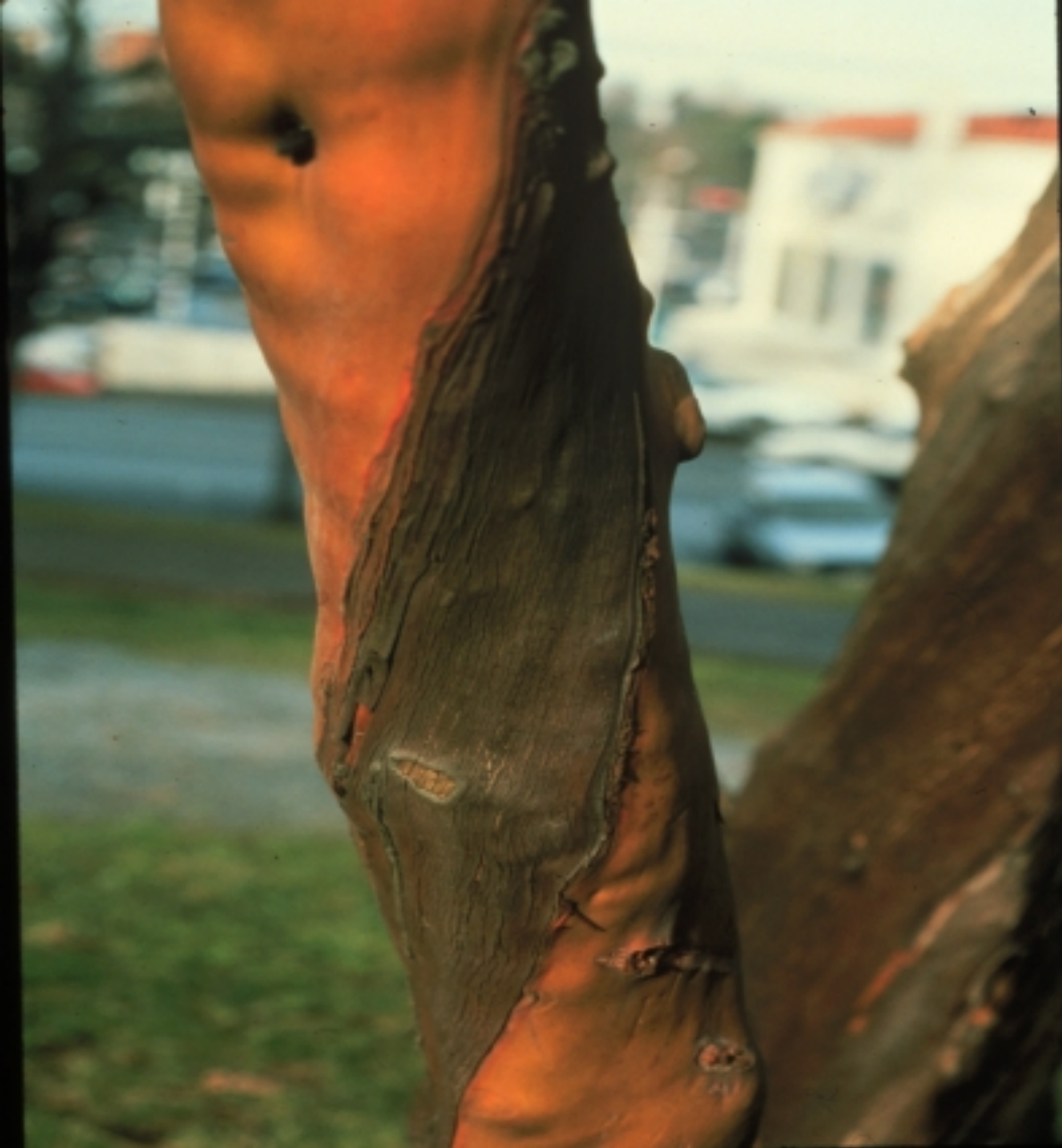
Plate 5-5 (above). Natrassia canker on madrone, showing the characteristic spiralled trunk. Sunken cankers develop and are surrounded by callous tissue. Girdling cankers cause extensive dieback.

Plate 5-3 (preceding page, upper right). Madrone shield bearer ( Coptodisca arbutella ) causes holes or circular brown mines. Holes are made when the insect weaves leaf surfaces together to pupate. This pupal cell drops to the ground creating the shothole appearance.