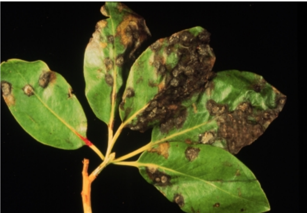
Plate 5-2 Leaf gall (blisters) caused by the fungus Exobasidium vacinii . Round, dark brown blisters form on the upper leaf surface; a white fungus growth forms on the underside and on infected fruit (byther, et al. 1996).