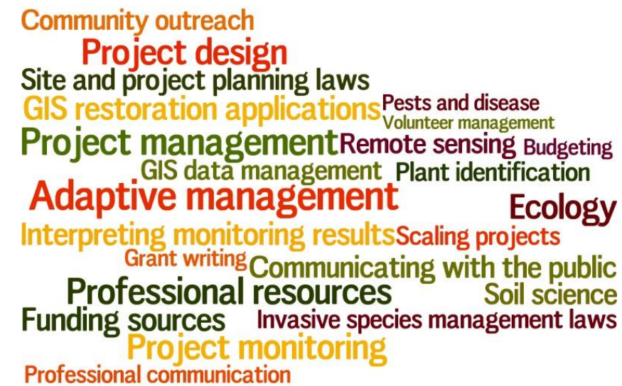
The level of interest survey participants expressed in a variety of potential continuing education topics.

Interviews: The interviews provided valuable guidance. I gathered information regarding current professional shortcomings, existing opportunities, concerns, and challenges.