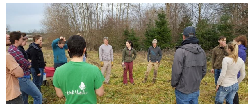
Group discussing restoration.

I will submit a program proposal to UWBG suggesting they offer a suite of one day seminars, two day symposia and field trips. UWBG will evaluate my program proposal and may begin offering courses as part of a restoration focused program as early as fall 2016.