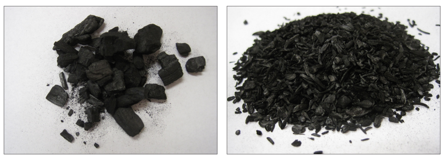
Figure 1. The material shown on the left is too coarse to be considered a high quality biochar, while the fine-textured material on the right is a high quality biochar.

The best biochar consists of finely textured, porous particles made by using extremely high temperatures (at least