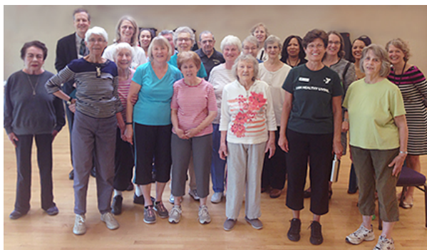
CDC site visitors and HPRC staff visit an EnhanceFitness class at the Matt Griffin YMCA.

The previous 5-year CDC award enabled HPRC to bring more than $20 million into Washington state to conduct research on topics ranging from cancer screening techniques to physical activity assessment and employee health . This new grant will allow the center to continue and expand on 40+ ongoing research projects aimed at improving the health of older Americans.