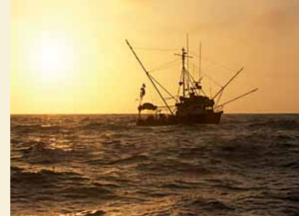
THE DAY'S CATCH. A commercial fishing vessel off the coast of Santa Cruz, California returns to port.