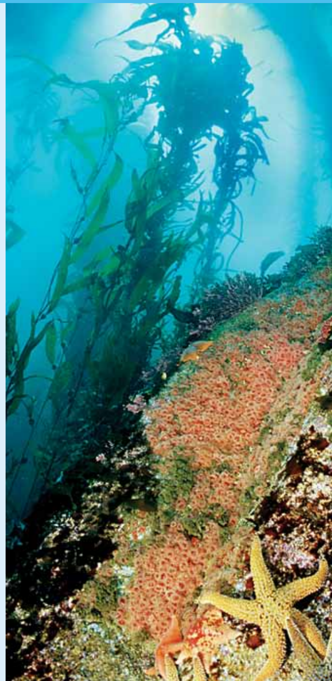
PACIFIC ECOSYSTEM. An ochre sea star make a kelp forest home in Monterey Bay, California.