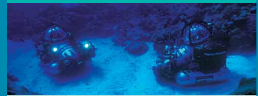
UNDERWATER EXPLORATION. Deep Worker submersibles explore the Flower Garden Banks National Marine Sanctuary in the Gulf of Mexico. (above)