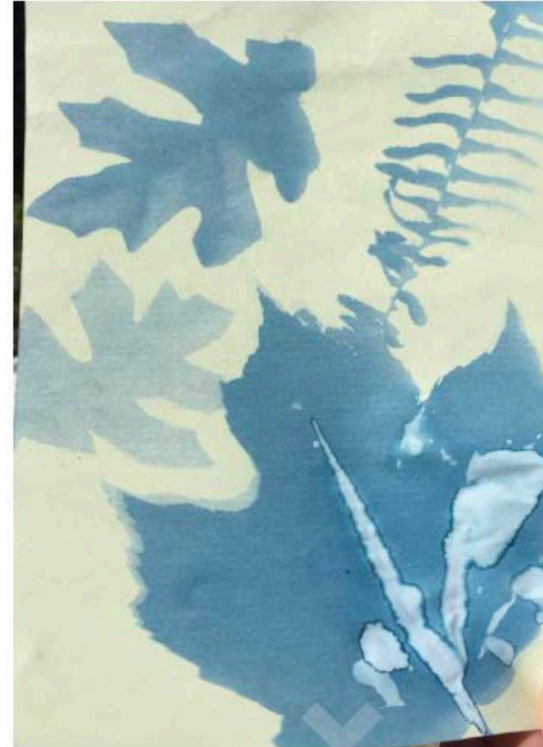
Final work! This is what the page should look like once you have removed the objects and sprayed the sheet with water.