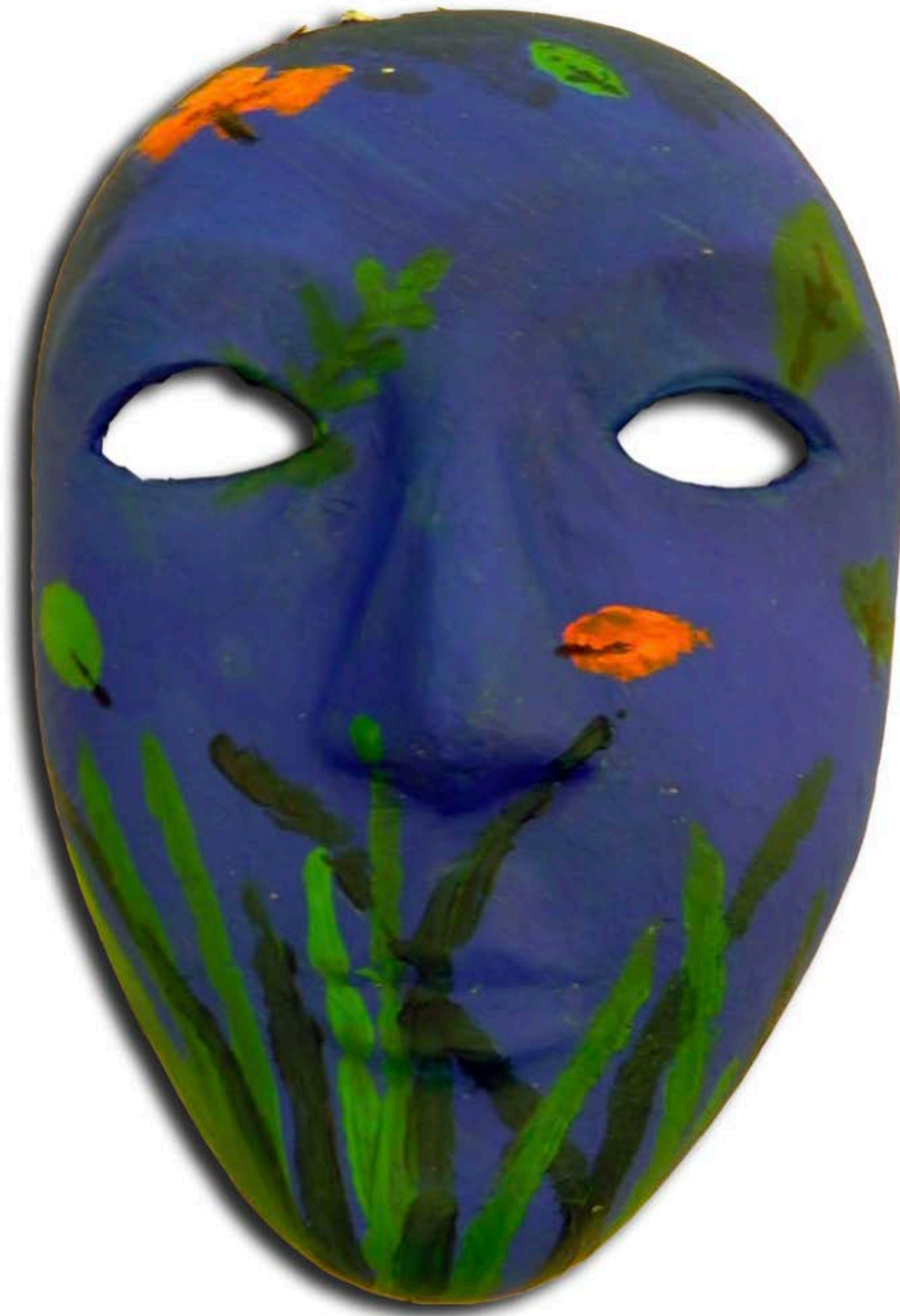
Uniformed Services University and the National Intrepid Center of Excellence