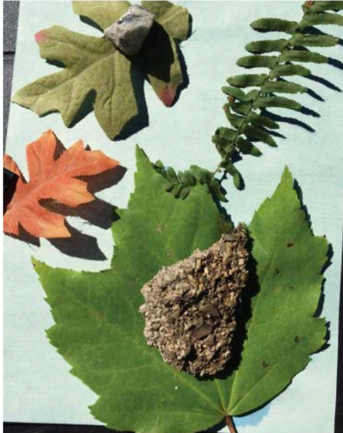
Objects put down on paper to be exposed to the sun's rays.