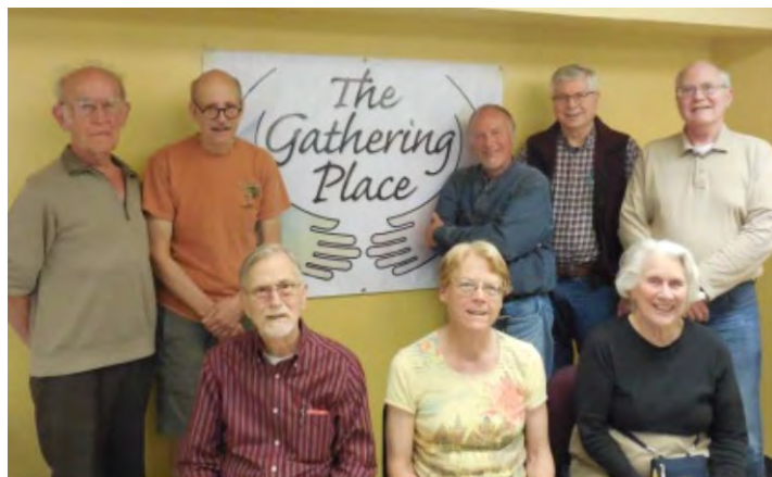
Members of The Gathering Place

This group spent many months thinking about what they most want to tell others who are newly diagnosed with memory loss or dementia. Here is their heartfelt message: