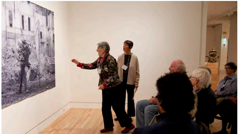
Frye Art Museum’s here:now program.