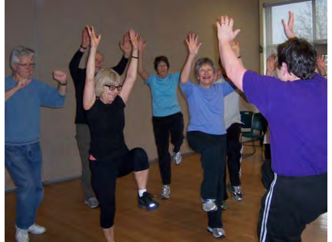
“Minds in Motion” class

for people with memory issues. It’s called “Minds in Motion.” It’s a great class. And I’ve gotten so many ideas from our support group.”