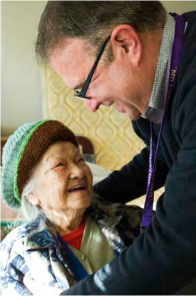
Many companies and agencies offer in-home care.

For more adult day programs in Washington state, visit www.leadingagewa.org/members/adult-day .