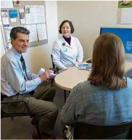
A family meeting at the Memory and Brain Wellness Center