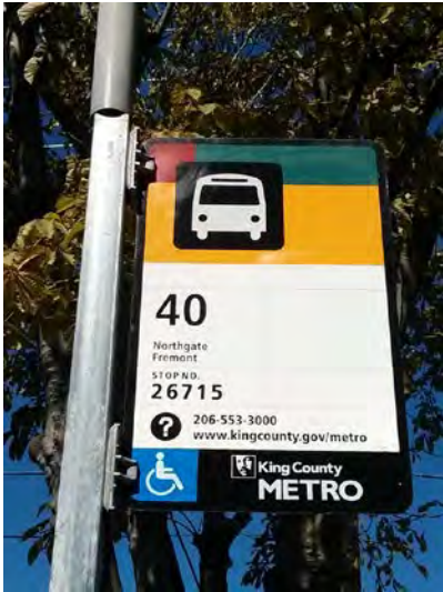
The sign at a Metro bus stop gives the route number and tells where the bus is going.