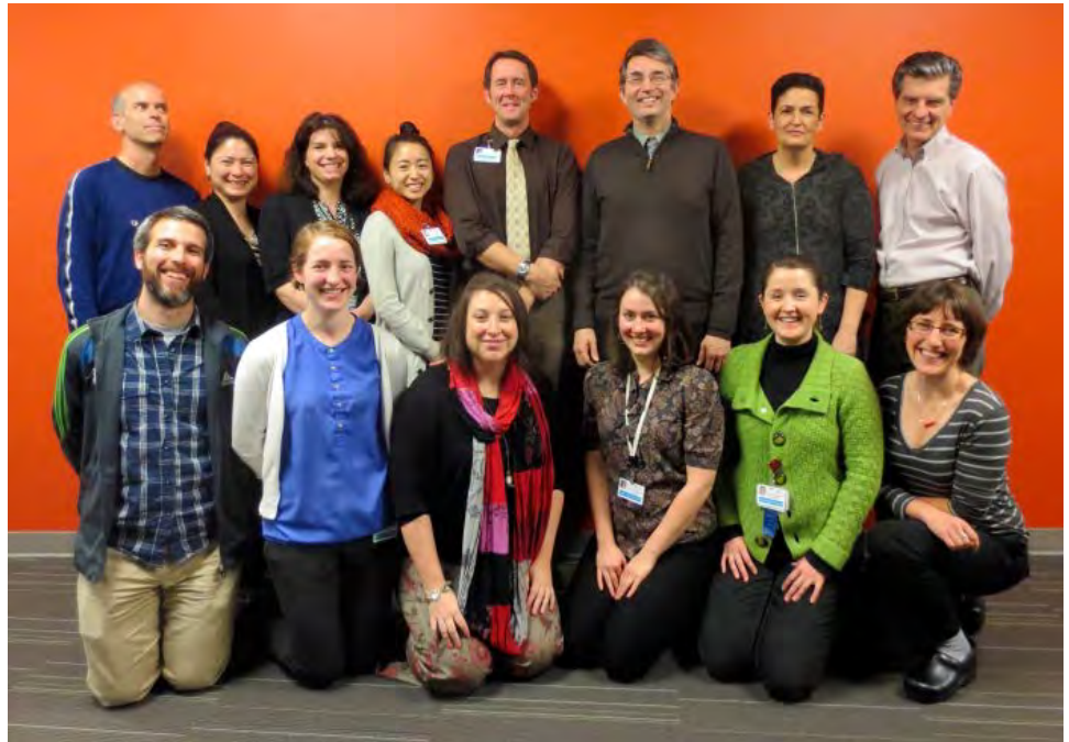
Some team members at the UW Medicine Memory and Brain Wellness Center

We also work with research teams at the Alzheimer Disease Research Center for Alzheimer disease and frontotemporal dementia, and the Pacific Northwest Udall Center for Parkinson disease.